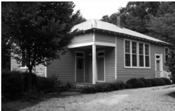
(1) FIRST UNION SCHOOL ~ 1522 Old Mill Road

Five distinctive homes and a restaurant will be open for the Goochland County Historical Society's 2008 House Tour, the Society's 25th tour since 1979, with proceeds supporting the mission of the Society to preserve and present the rich history of Goochland County. The 2003 Survey of Historic Architecture in Goochland County, conducted for the Virginia Department of Historic Resources and the Society, states that "Crozier is potentially eligible for listing in the National Register of Historic Places as one of the county's most intact rural villages."